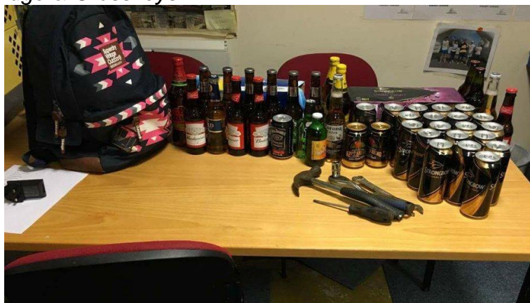
This tweet received over 1,800 impressions

Community Safety Wardens confiscated 75 items of alcohol from underage drinkers last night in Newbridge & Crosskeys